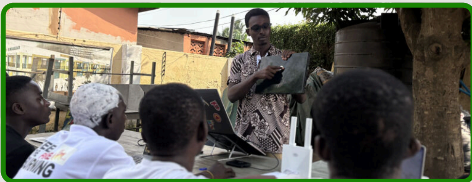
Click any of the pictures above!