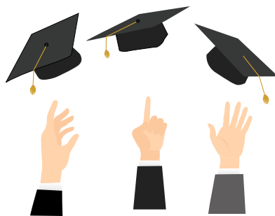
Graduation & Induction Ceremony