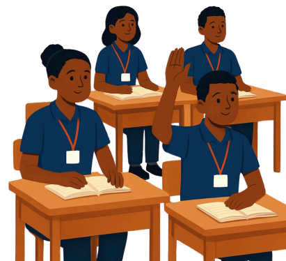
CLP Crystal Cohort 2