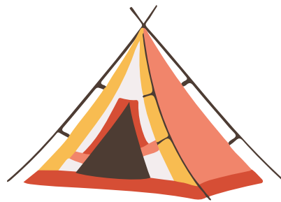
Cohort 7 final camp