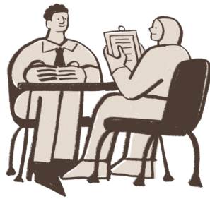
Cohort 8 Interviews