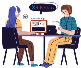
CLP Thought Leadership Series