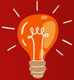
Discovered the CLP experience

On Saturday, 22nd November 2025, 50 young adults in Cape Coast came together for A Taste of CLP. This interactive session introduced them to the CLP journey and taught them how to lead teams for impact.